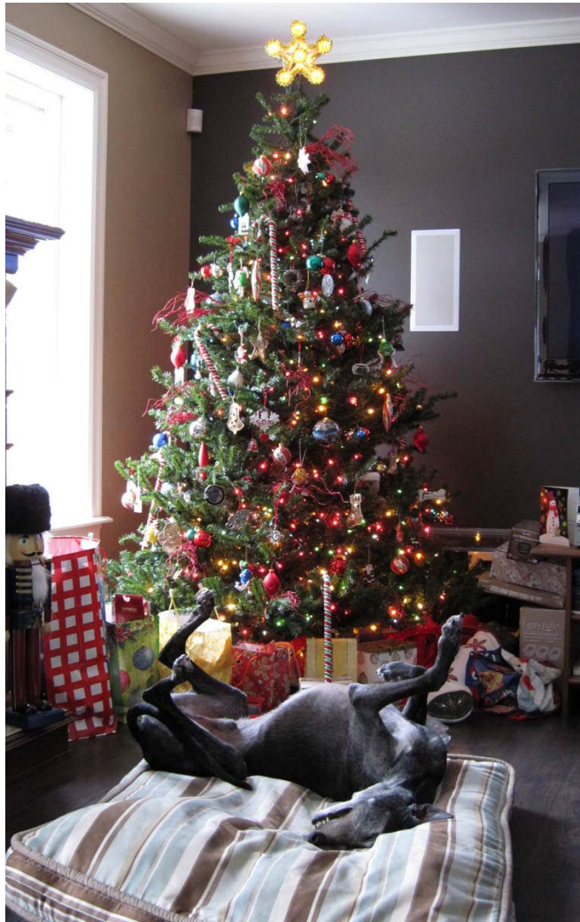
Darcy enjoys a Xmas snooze under the tree.